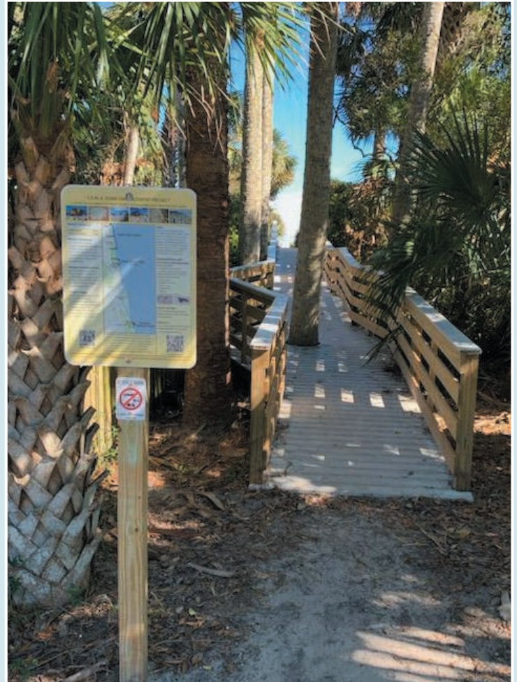
New Beach Walkway at San Juan Drive and Ponte Vedra Boulevard.